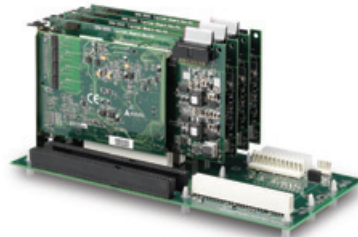
SSI bus cable for multiple cards synchronization

Termination Board with a 68-pin SCSI-II Connector and DIN-Rail Mounting (Including One 1-meter ACL-10568 Cable)