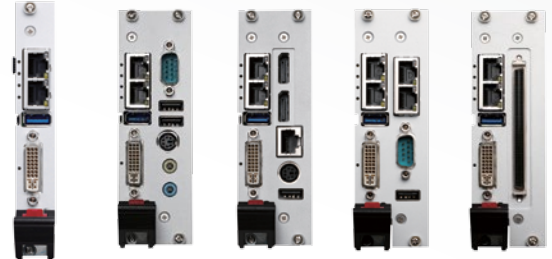
cPCI-3510 cPCI-3510D cPCI-3510G cPCI-3510L cPCI-3510M