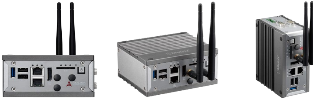
MXE-200/200i with Antenna