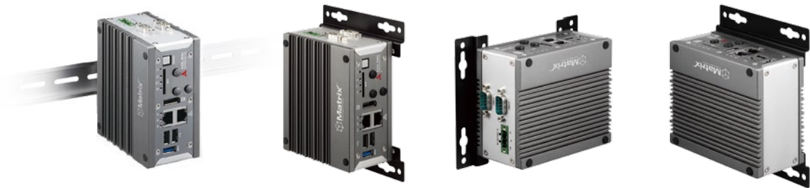
The MXE-200/200i is easily installed in popular mounting configurations, including DIN rail and wall mounting.