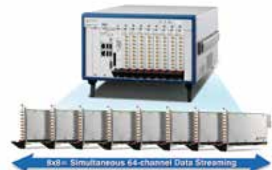
Equipped with ADLINK PXES-2590 PXIe chassis and PXIe-9848 modules, high density testing system with up to 64 channels can be implemented. Note: For PXES-2590 details, please refer to pages 1-13.

The PXIe-9848H's signal conditioning module provides 8 simultaneous analog inputs and 15:1 or 50:1 attenuation ratio, implemented with solid product design and strict verification testing to ensure maximum performance, thereby enabling the high dynamic performance of 63.5 dB SFDR and 55.5 dB SINAD while supporting high input voltage range of \pm 100 V.