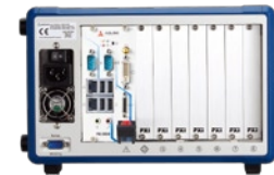
PXIS-2558T Back View