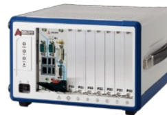
PXIS-2508 Front View