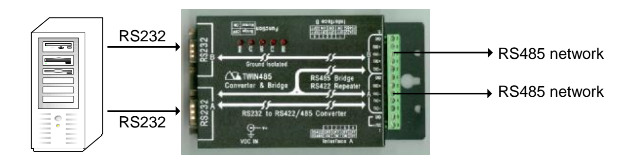
On Line Monitor function & redundancy backup in one Box.

3. When you need to connect with other RS485 equipment currently, you need to use TWIN485 box. One TWIN485 box can support ground isolated feature between PC COM port and RS485 equipment. Because there are two RS232 to RS485 converters in TWIN485 box. So one converter can be your working unit and the other converter can be your monitor/backup unit. Because TWIN485 box also support RS485 bridge function. So you can just prepare one type of TWIN485 box in your RS485 application environment. In traditional environment you need to prepare RS232 to RS485 converter box and RS485 to RS485 bridge box. It is not easy to maintain and pay much in stock. Because converter box can not be used as bridge box and bridge box can not be used as converter box. So you need to prepare both types of box in stock. Now, you can know TWIN485 box is your ideal partner in RS485 environment.