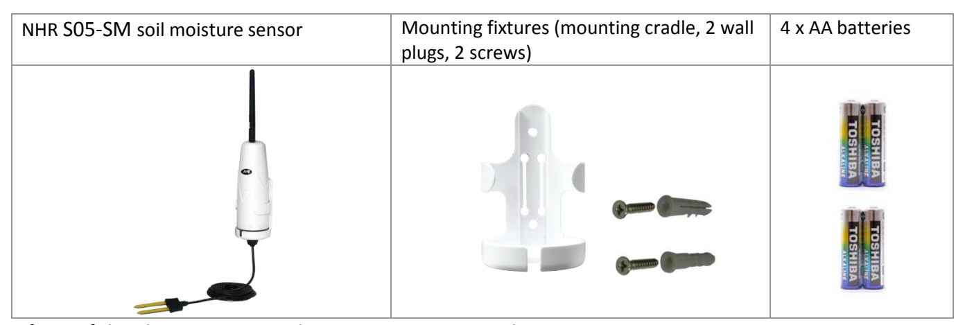
If any of the above is missing please contact your supplier.